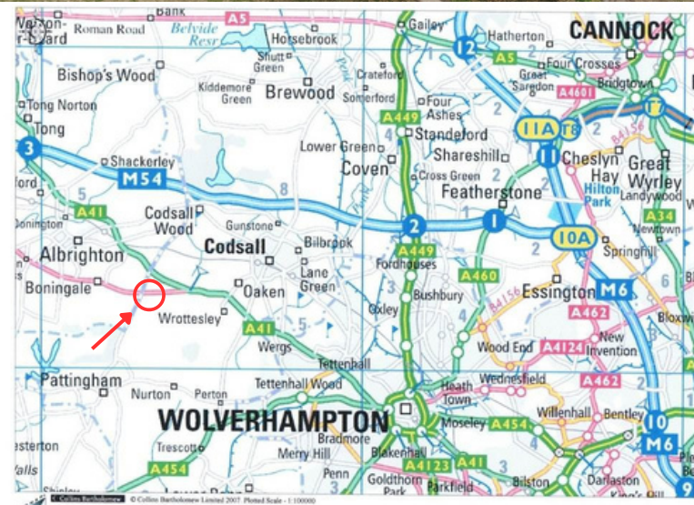
This map was created with Promap